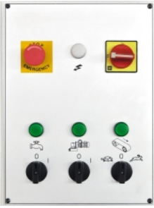
Double speeds motor