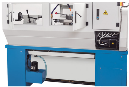
The work area is also accessible through large swinging doors on the back of the machine