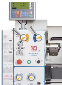
Positioning indicator on X, Z and Z1 axis