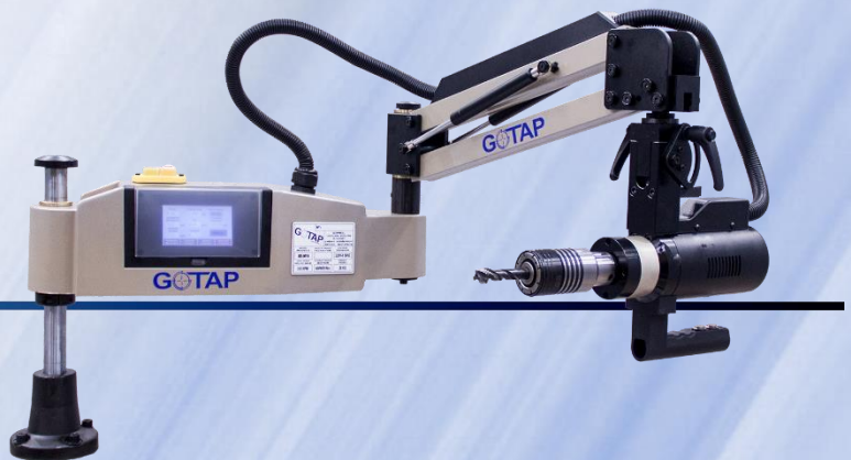
MOD. REO M16