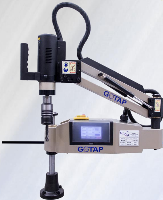
MOD. REV M16