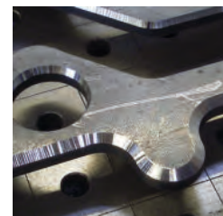
fig. 45°-bevel-milling head with 4 cutting edges and guide roller, equipped with 4 bevel-indexable inserts of type D