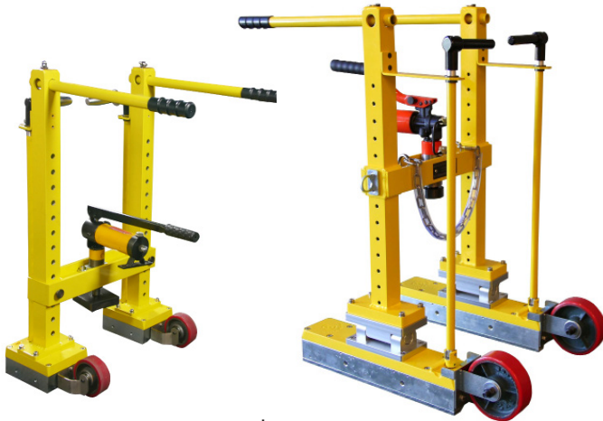
8800605 | 81001171